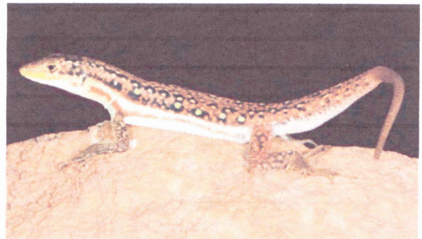
Pedioplanis lineocellata lineocellata —Tswalu Kalahari Reserve, NC W. Conradie