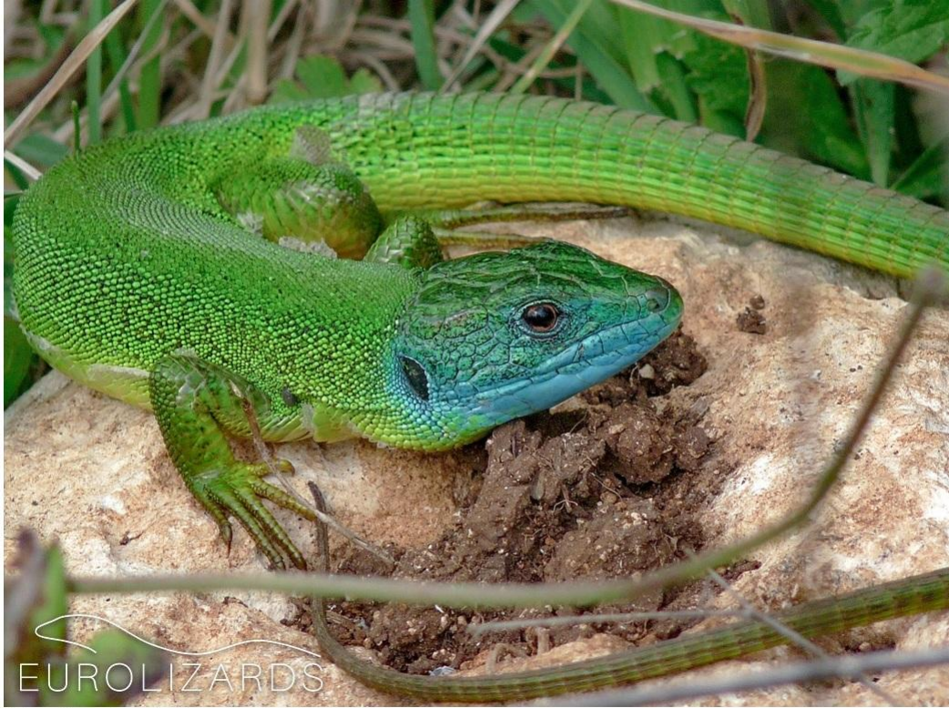
Subsp. chloronota, male: I/ Cava Grande (Sicily), 01.04.2009