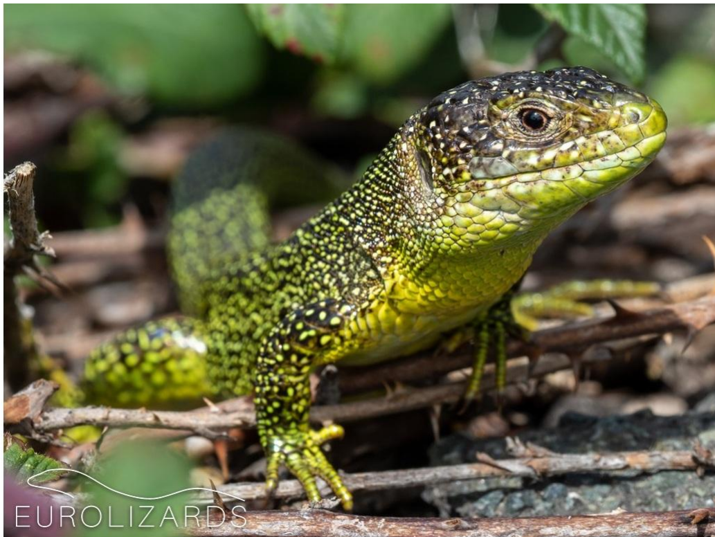
Male: E / La Póveda de Sorla, 01.09.2019 - The populations of Castilla y León mark the western distribution limits of this species.