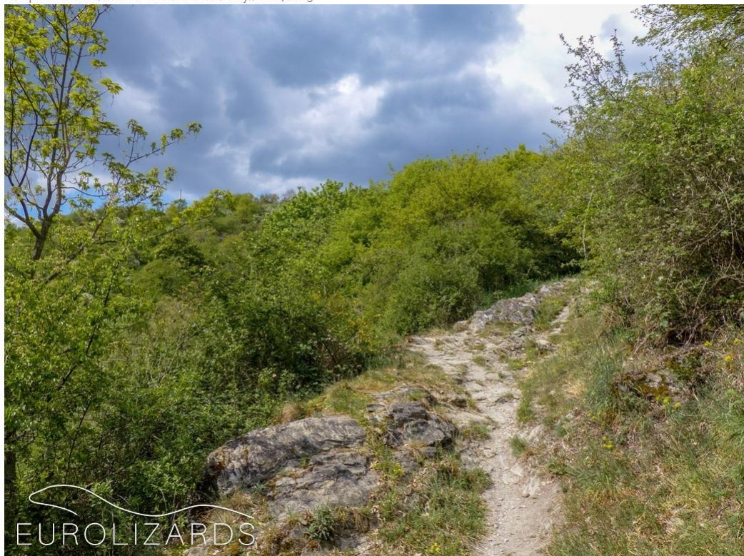
A slope of the Rhine Valley (Germany): Habitat of Lacerta bilineata and Podarcis muralis .