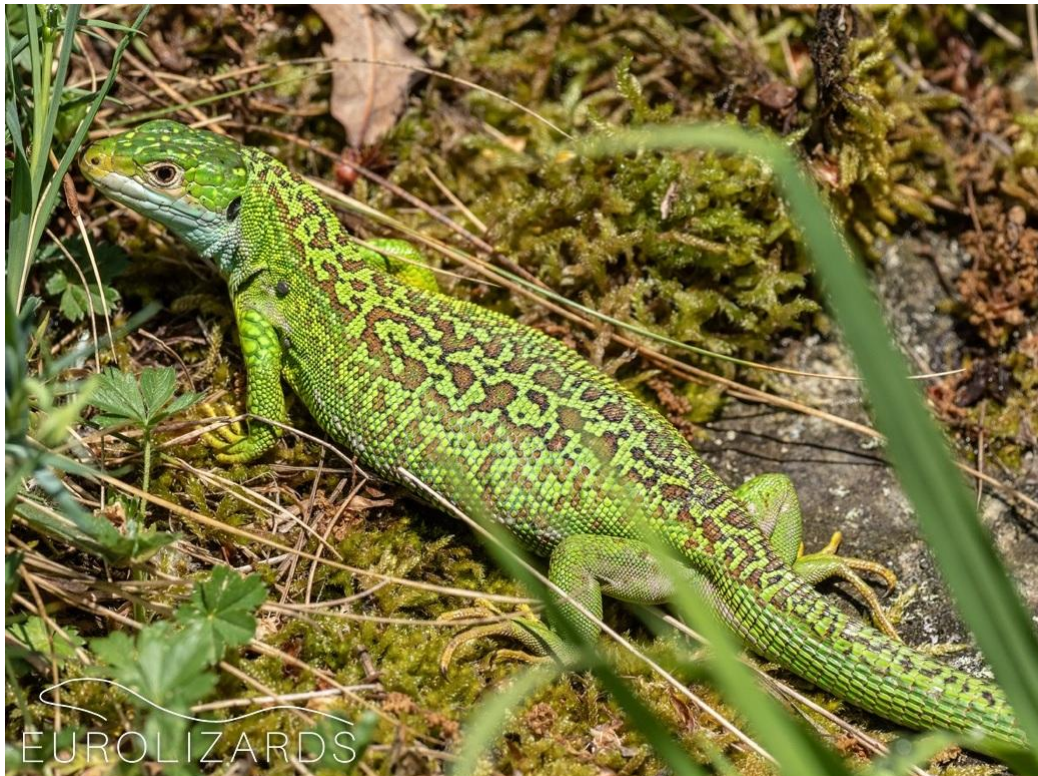
Subsp. bilineata, female with uncommon pattern: D / Rhineland-Palladium, 11.05.2018