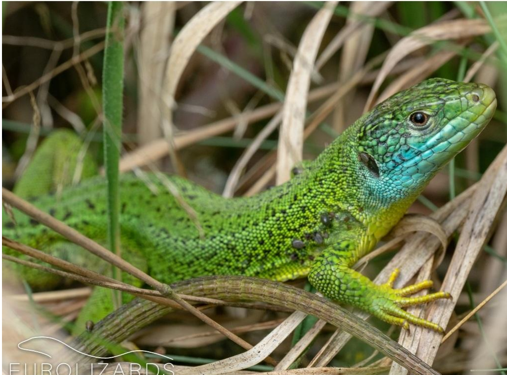
Subsp. bilineata, male: D / Rhineland-Palladium, 11.05.2018 - Note the bluish head.

The Green Lizards are somehow European flagship species - at least in Central Europe with its rather poor Lacertid fauna. These conspicuous green, big-sized lizards appear rather "exotic" in the temperate zones of Europe.