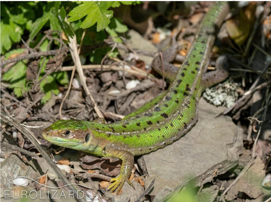
Subsp. bilineata, female: D / Rhineland-Palladium, 11.05.2018 - Note the two light dorsolateral lines which gave this species its name.