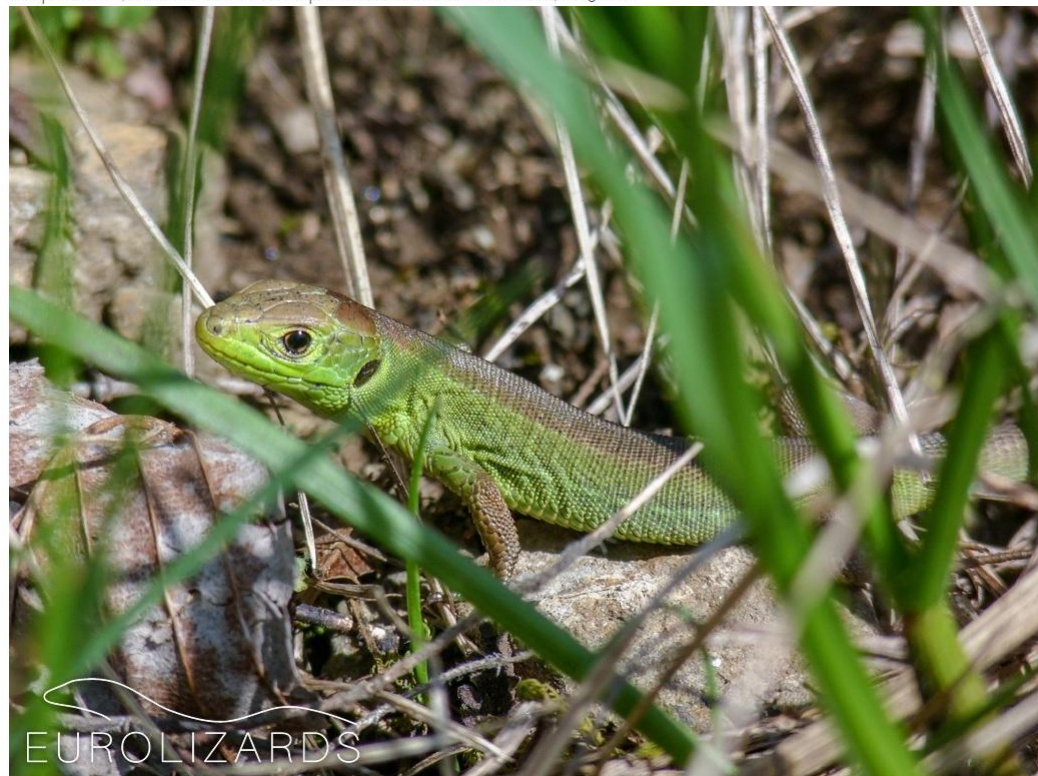
Subsp. bilineata, juvenile: D / near Freiburg, 03.04.2011 - Juveniles frequently show greenish throats